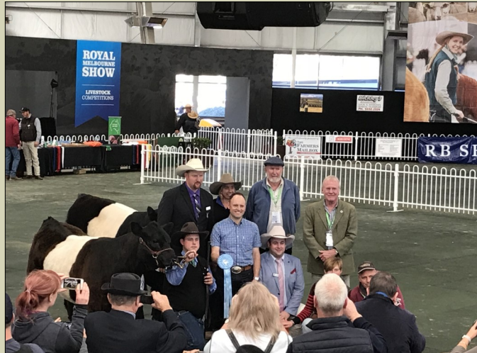
Royal Melbourne Show