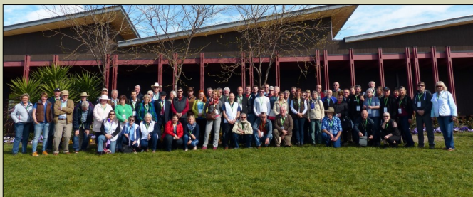
Delegates at the Chocolaterie in the Yarra Valley

Glenthompson Pastoral Estate was the second farm of particular interest. That farm was over 8,000 acres and home to 7,000