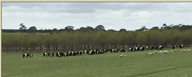
A herd at Glenthompson Pastoral Estate

Many of the International Delegates are looking forward to returning to our country. If you have any questions or would like to support the 2020 World Galloway Congress in any way, please email me at info@sherwoodacresbeef.com .