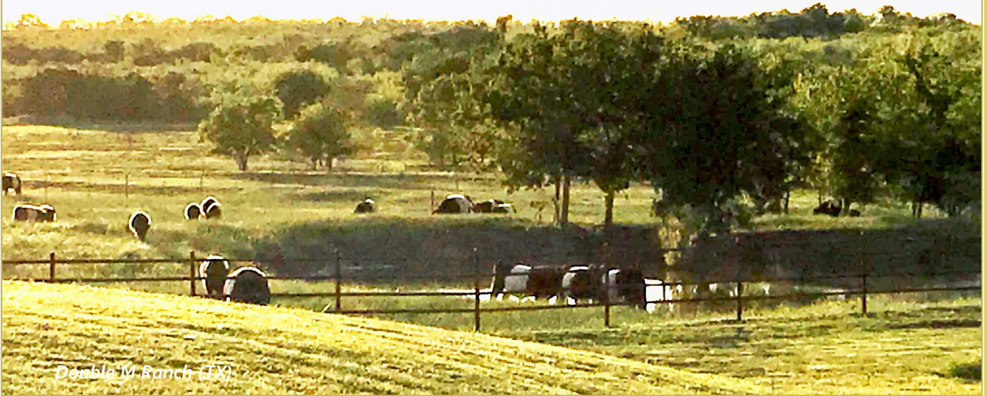
Double M Ranch (TX)